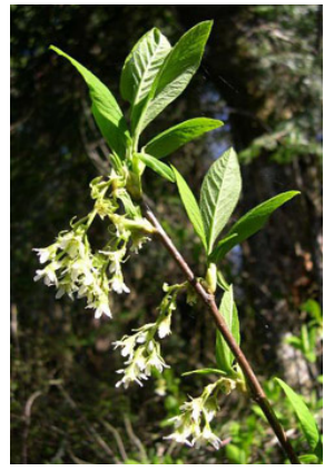
Indian Plum Rousseau, 2006

Indian plum ( Oemleria cerasiformis ) is a shrub or small tree (1.5-5 m tall) with smooth, purplish-brown bark, and is one of the first woody plants to bloom in the spring. The leaves are pale-green, broadly lanceshaped, and smooth-margined. The flowers are in small clusters, bell-shaped, and greenish to white in colour. The small long fruits are pink to blue-purple (when ripe) and are edible but rather bitter. Indian