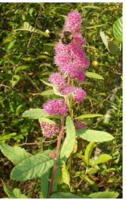
Hardhack DND, 2006

Hardhack (Spiraea douglasii) is a shrub commonly found in open riparian areas where they form tall thickets of wiry stems. The stems are generally multi-branched and have large terminal clusters of small pink flowers that form spires. The leaves are toothed toward the tips with undersides that are whitish with prominent veins. It can be harvested